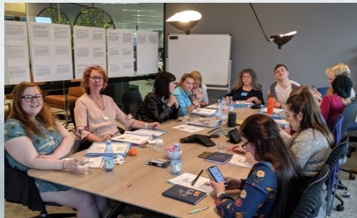
Leadership Day 2019

Part of the leadership day was facilitated by executive support and coaching specialist firm, Spique, who deconstructed the neuroscience behind leadership, including the difference between armoured and daring leadership. The Youth Leaders were able to share their stories with Hamilton Locke members in a safe, empowering environment. Our team also provided the Youth Leaders with a Q&A opportunity to discuss some of our lawyers' personal journeys.